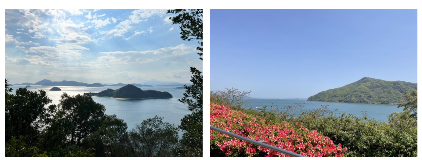
Seto Inland Sea